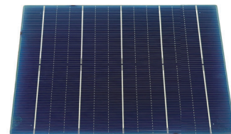
5BB PV cell